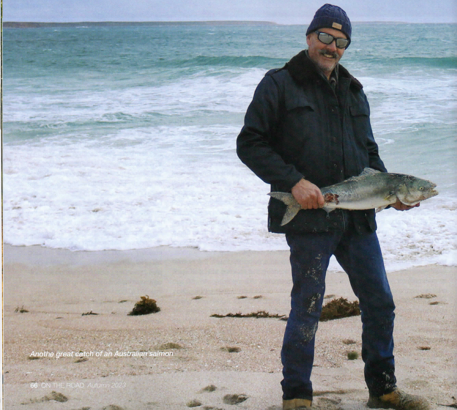
Another great catch of an Australian salmon