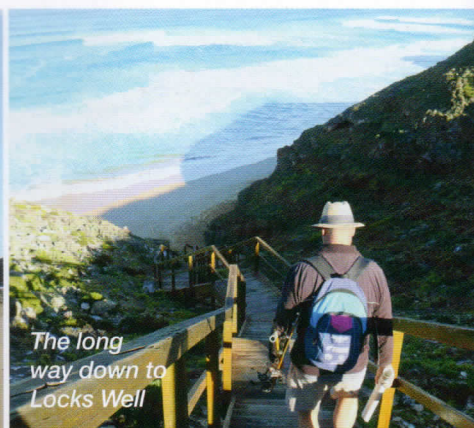
The long way down to Locks Well