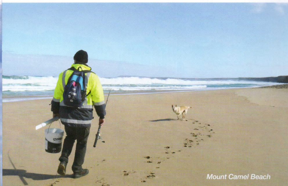
Mount Camel Beach