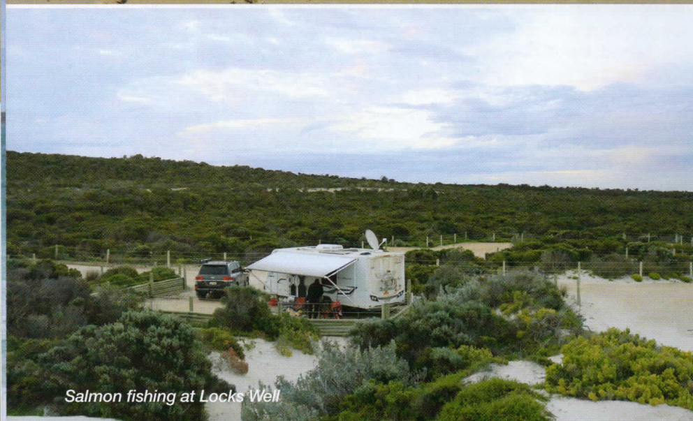
Salmon fishing at Locks Well