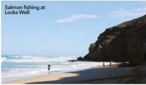
Salmon fishing at Locks Well

After the excitement has died down, don't forget to take the brag photos too! 📸