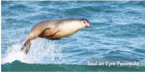
Seal on Eyre Peninsula