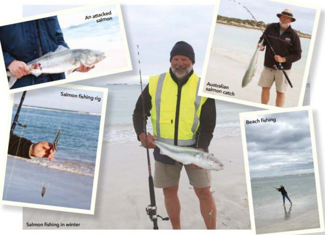
An attacked salmon