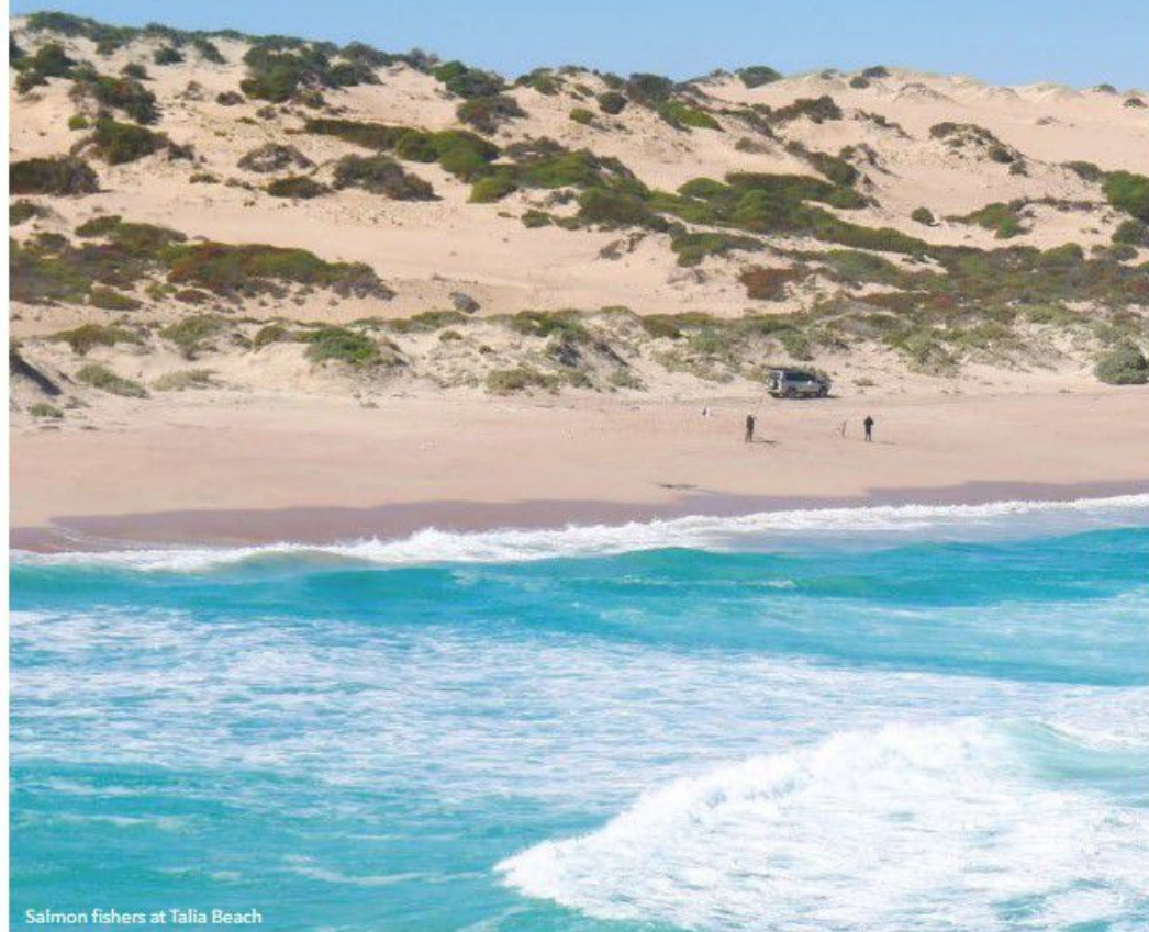
Salmon fishers at Talia Beach