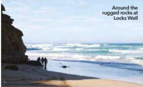
Around the rugged rocks at Locks Well